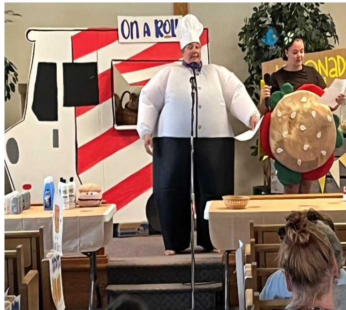
Food Truck: On a Roll with God!